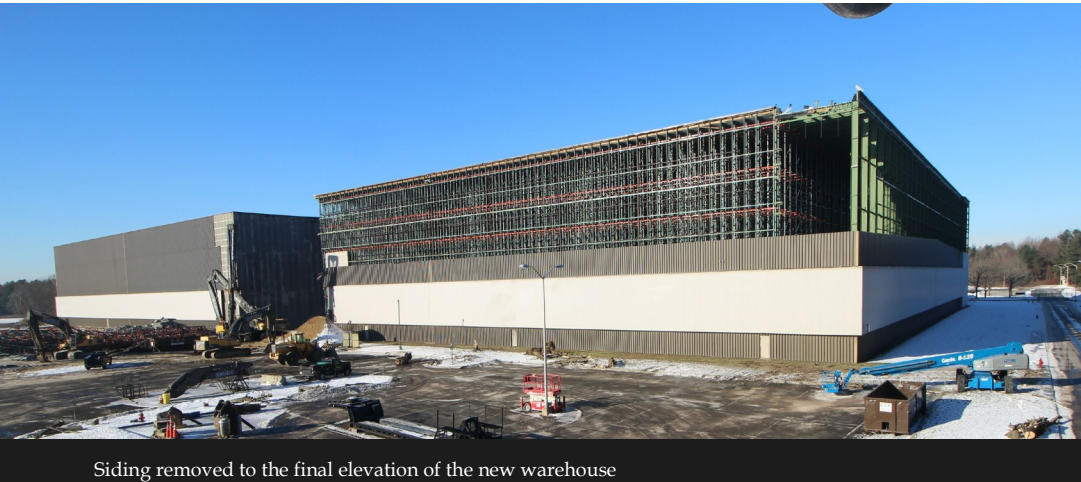
Siding removed to the final elevation of the new warehouse

Abatement work began in late 2016, removing asbestos-containing caulking and other materials from the portions of the building impacted by the demolition scope. Costello and New England Yankee worked closely together to deliver an aggressive phased schedule.