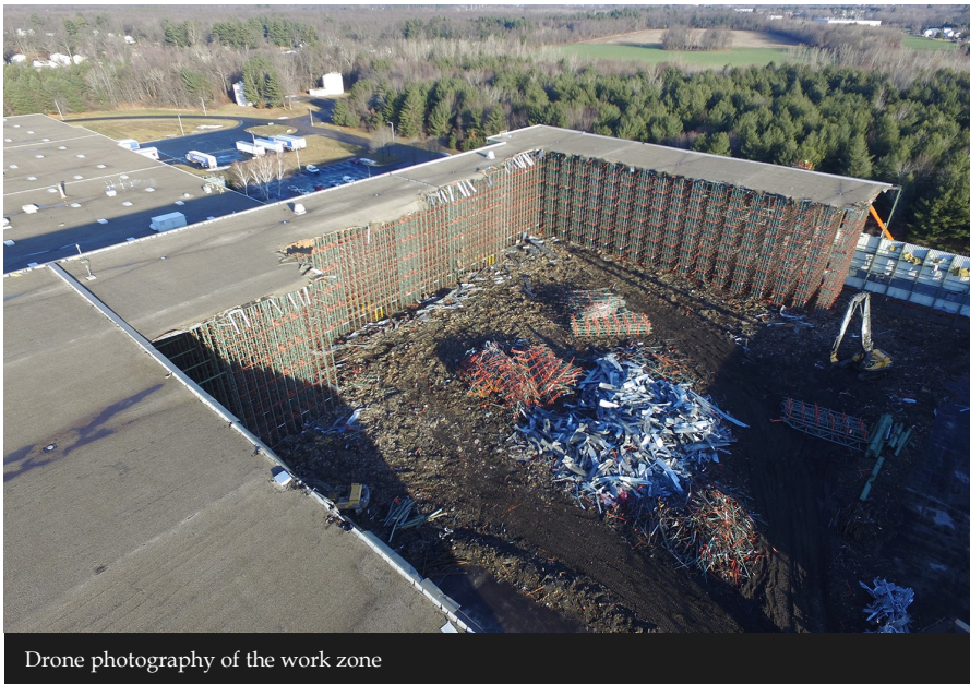
Drone photography of the work zone