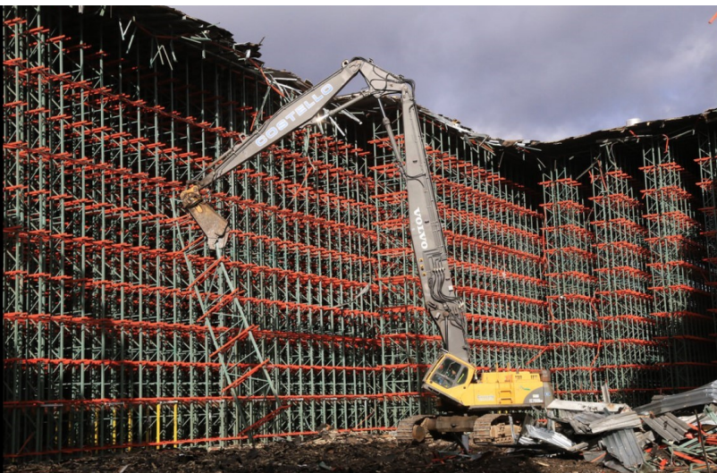
Demolition of the rack system